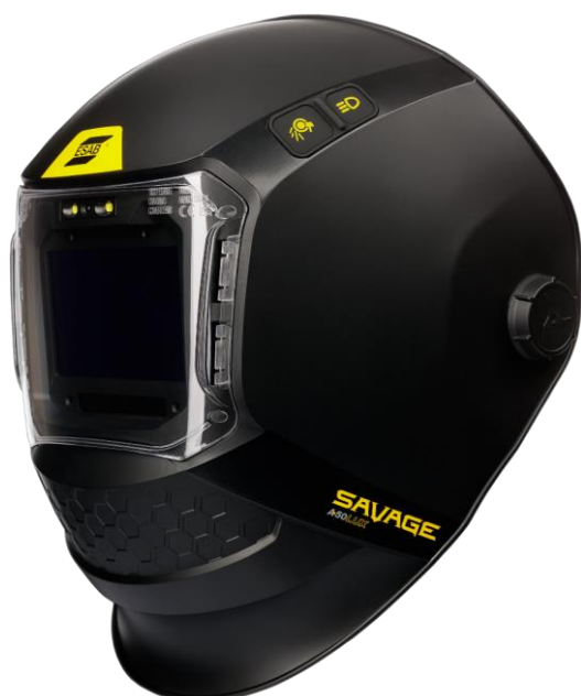
SAVAGE A50 LUX